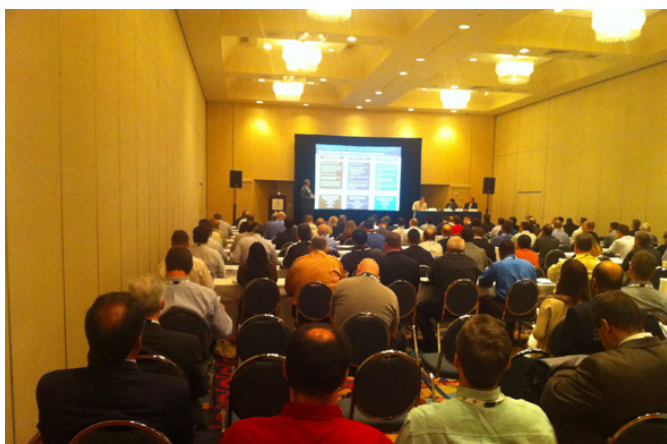
The Main Conference Sessions

“An excellent event. It was fantastic to meet with people who are at different points selection, implementation and online process. So much knowledge in one spot”, Transport Canada