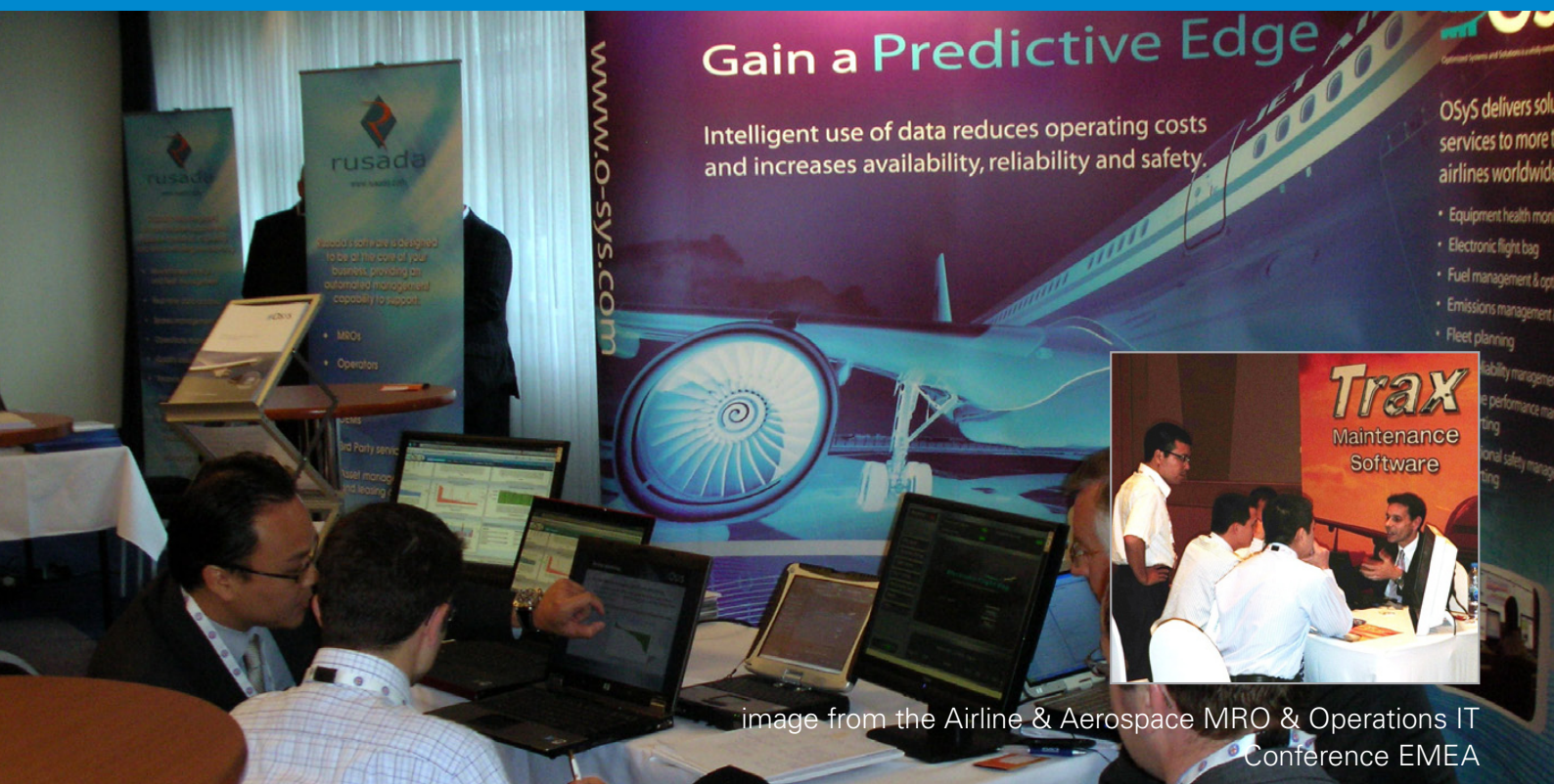
image from the Airline & Aerospace MRO & Operations IT Conference EMEA