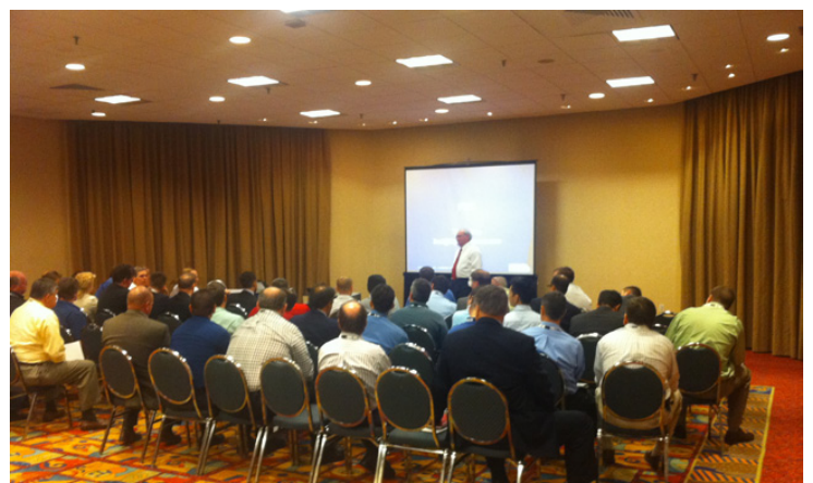
A Typical Workshop Session