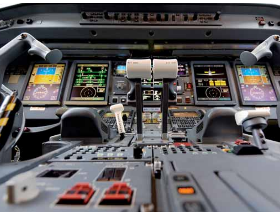
The four members of the E-Jets family have fly-by-wire flight control systems and identical flightdecks, giving them qualification.

Time on the ground for any aircraft is wasted money for an operator, so the E-Jets are equipped with integral airstairs at the forward passenger door to aid fast